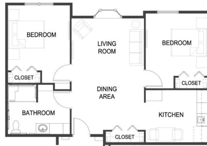
EKDAHL TWO BEDROOM