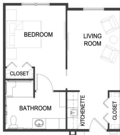
LEGACY & EKDAHL ONE BEDROOM