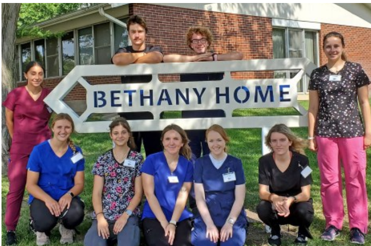
Sharing through teaching: CNA classes were back in full swing following disruptions of the pandemic.

“Blessings and gratitude are always easy to find at Bethany Village!” Kris Erickson, CEO